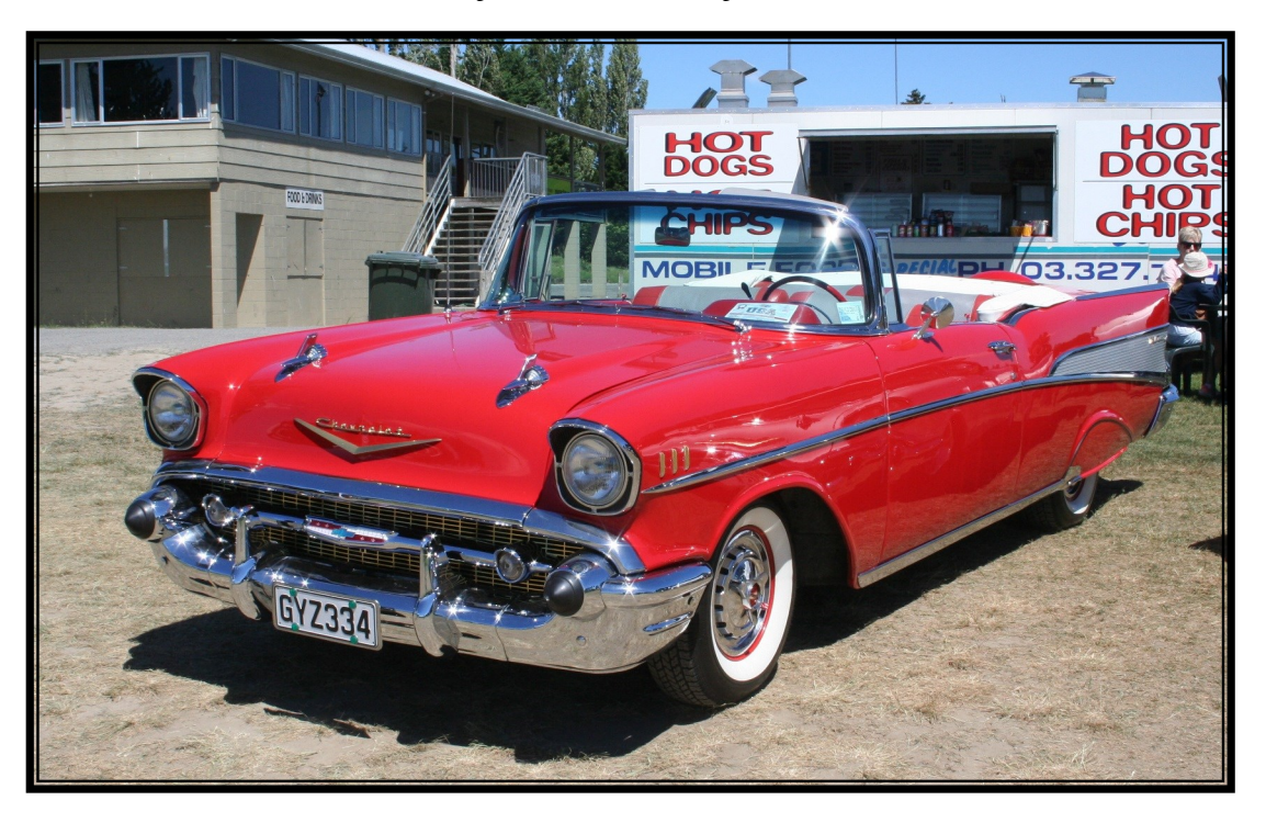
Top 10 place went to Graeme Trillo with his 1957 Chevrolet Bel Air Convertible.