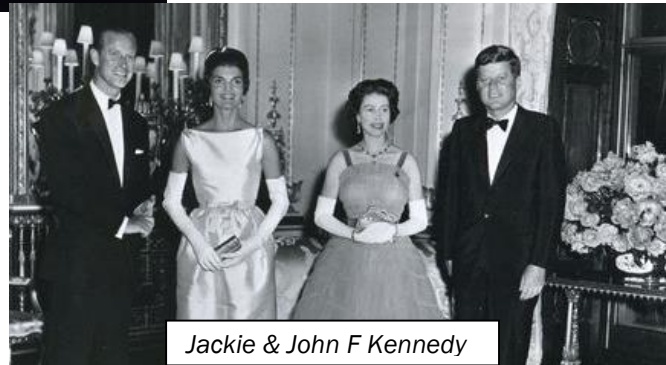
Jackie & John F Kennedy