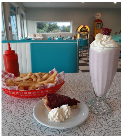
Yummy treats at Bernies

We need an indication of numbers for lunch, and meals are to be pre-ordered. If you could