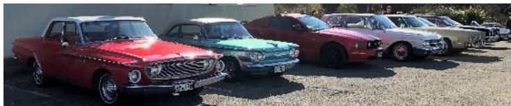
19 American cars and