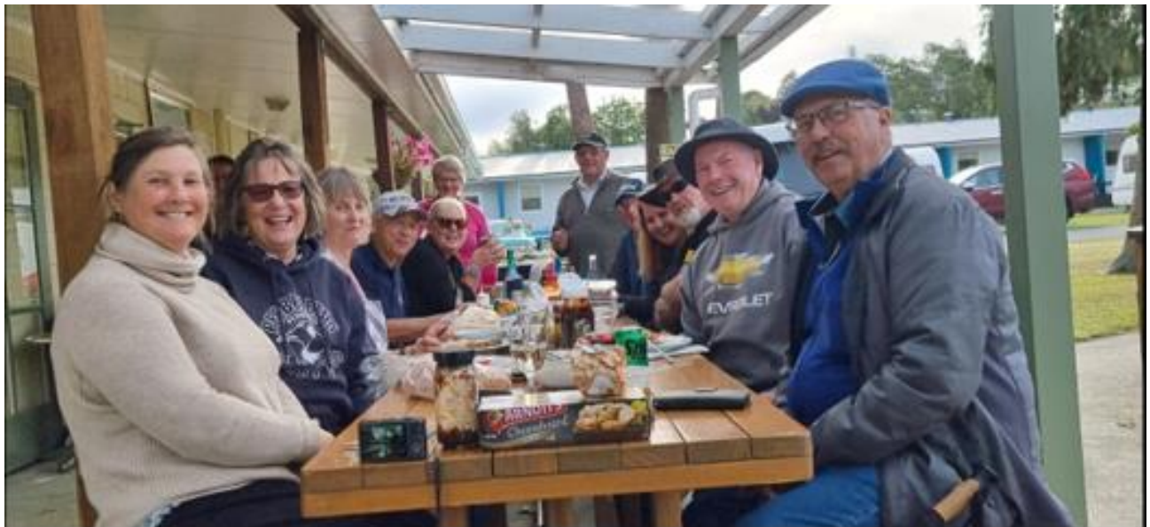
Some of the members staying for the weekend join together for a relaxing BBQ on the Saturday evening, at the Top 10 Holiday Park.