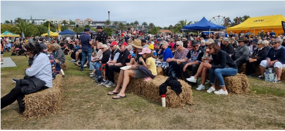
Large crowd enjoying the days entertainment.