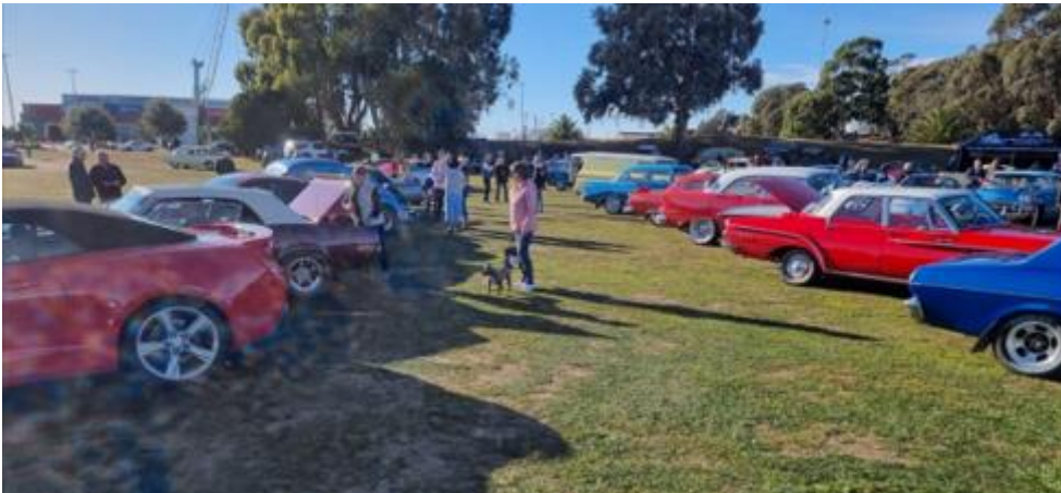
Club cars enjoying fun in the sun.

As usual your club was well represented by a regular group who take the opportunity to make a weekend away, plus others who join the group on the day and all park together. Then there are other club members who take the opportunity to make their own way and enjoy the day.