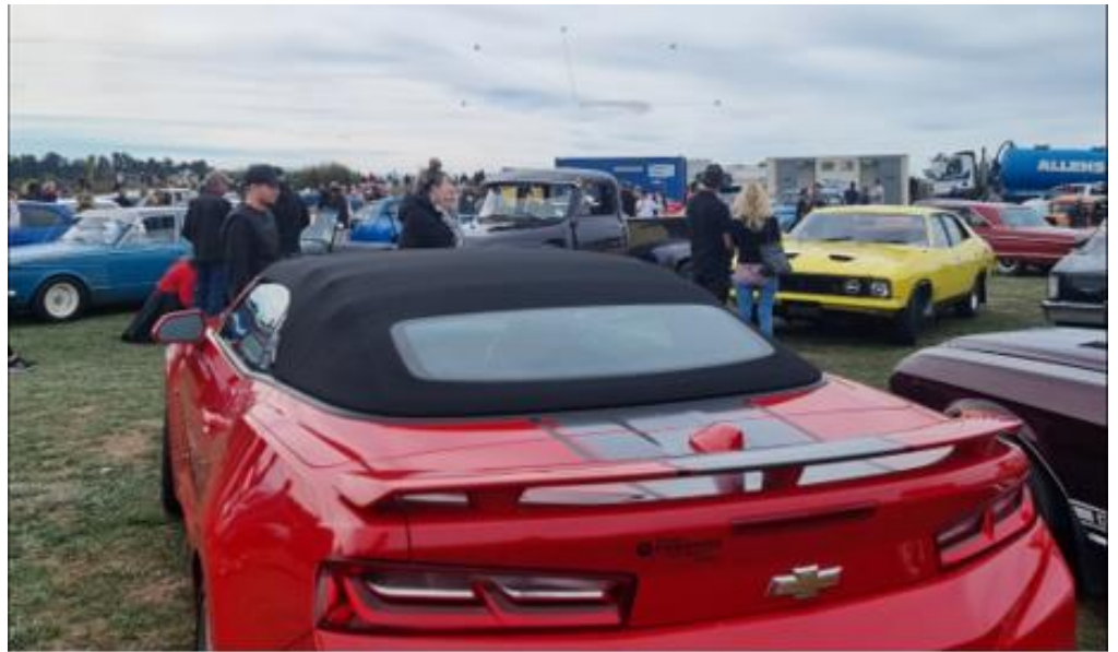
The Royal New Zealand Airforce can be seen in the distance, putting on an incredible display for the crowd. At times they passed very low overhead.